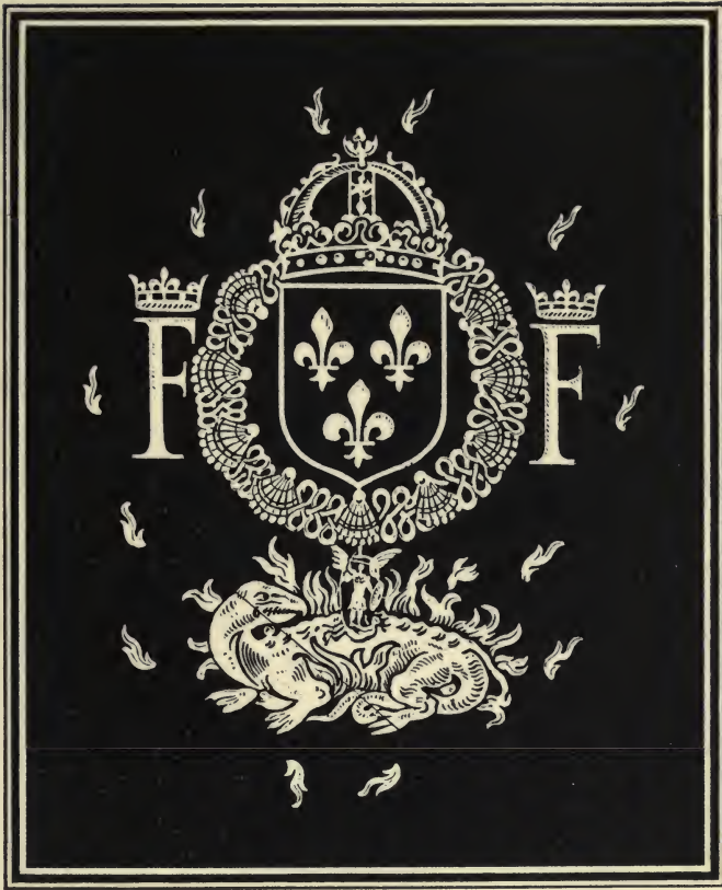
FRANÇOIS I ER .